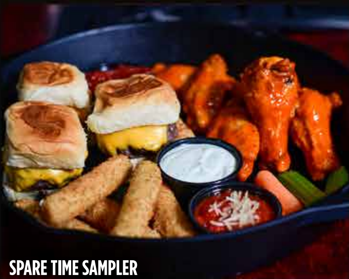
SPARE TIME SAMPLER

Our sampler platter features a full portion of some of our best signature appetizers. *Beef sliders, fried mozzarella sticks, and 6 bone-in wings.