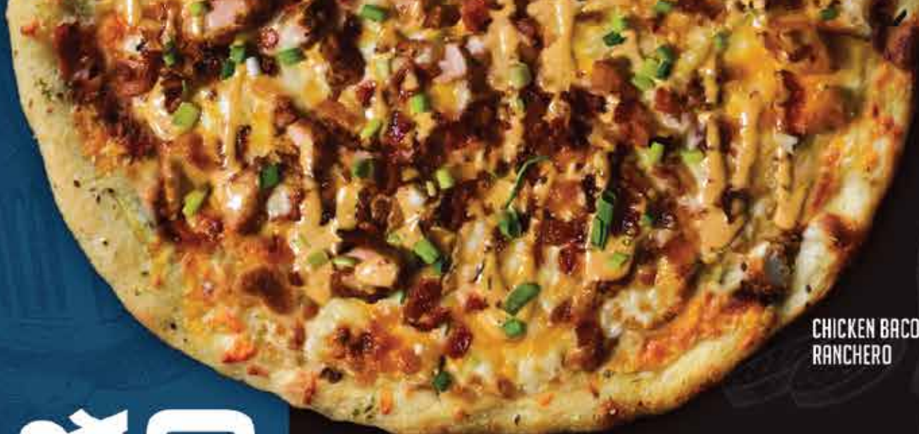
CHICKEN BACON RANCHERO

HOUSE-BLENDED TOMATO SAUCE & PREMIUM INGREDIENTS