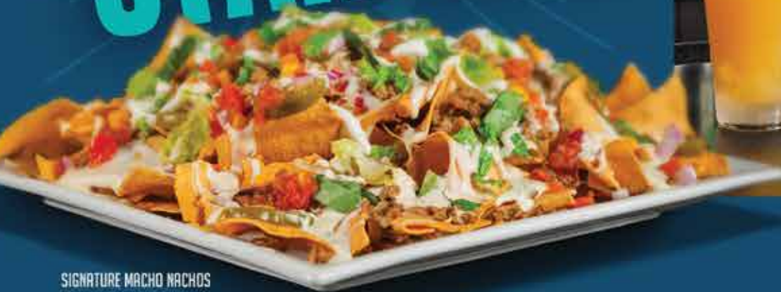
SIGNATURE MACHO NACHOS