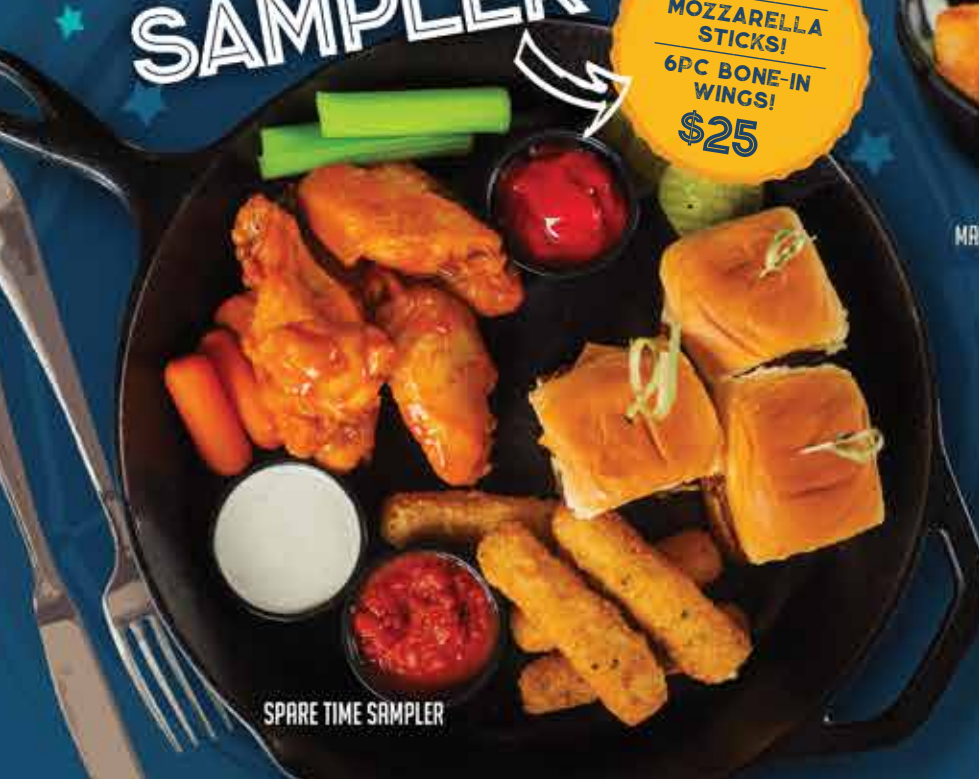
SPARE TIME SAMPLER

BEEF SLIDERS! MOZZARELLA STICKS! 6PC BONE-IN WINGS! $25