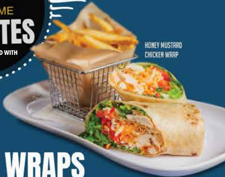
HONEY MUSTARD CHICKEN WRAP