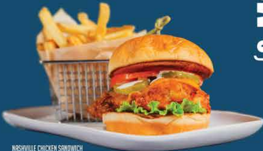
NASHVILLE CHICKEN SANDWICH

KING'S HAWAIIAN SWEET ROLL / BEEF PATTY / AMERICAN / LETTUCE / TOMATO / RED ONION - $13.50 DOUBLE BURGER - $17.50