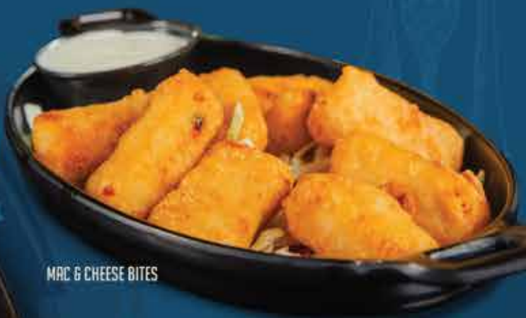
MAC & CHEESE BITES