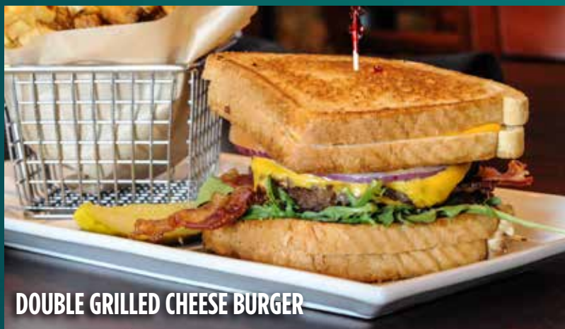
DOUBLE GRILLED CHEESE BURGER