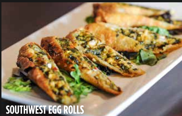
SOUTHWEST EGG ROLLS