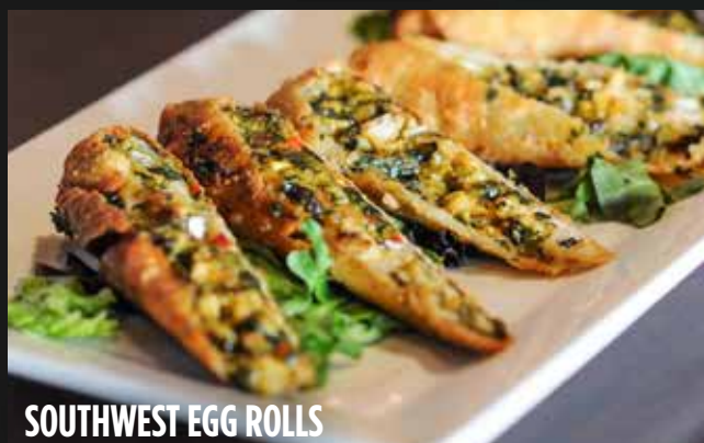
SOUTHWEST EGG ROLLS