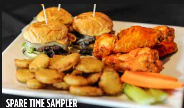
SPARE TIME SAMPLER