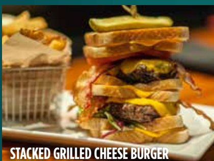
STACKED GRILLED CHEESE BURGER